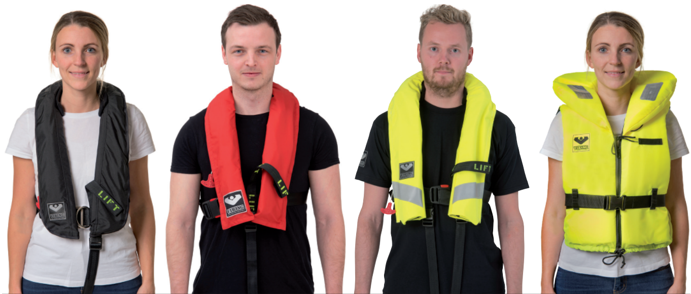
VIKING RescYou™ Conquest

Your safety is our bottom line. All lifejackets inflate in a matter of seconds, and are designed with essential safety features such as crotch strap, SOLAS-grade retro reflective tape and a lifting becket.