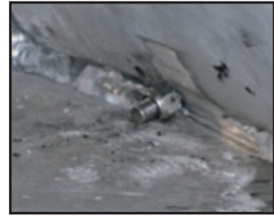
Stainless steel in alu- minium welded seam