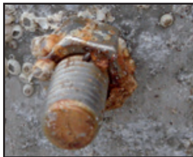
Corroded VA screw in aluminium