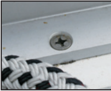
Stainless steel screw aluminium floor rail