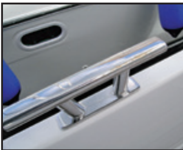
Stainless steel coating on aluminium hull