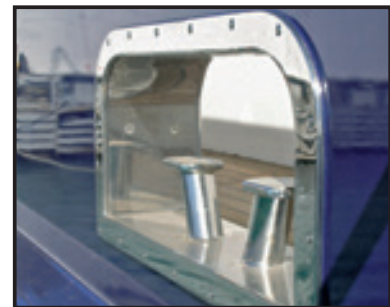
Stainless steel bracket in aluminium shell plate

TIKAL TEF-GEL® is a watertight, PTFE-based paste which prevents the blooming of metal and also reliably prevents corrosion from galvanic flows between unequal metals. In all places where refined metals come into contact with less refined metals (eg. aluminium with stainless steel), a small amount of TIKAL TEF-GEL® suffices to prevent galvanic exchange of electrons and subsequent corrosion.