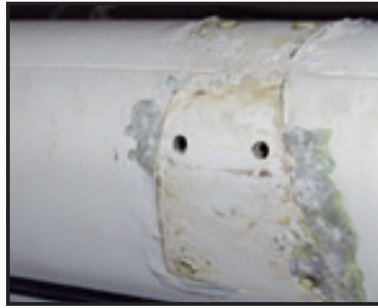
Corroded aluminium mast