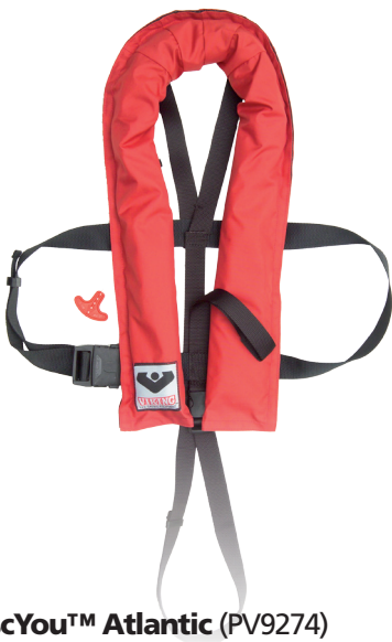
RescYou™ Atlantic (PV9274)

Your safety is our bottom line. All lifejackets inflate in a matter of seconds, are self-righting and designed with essential safety features such as crotch strap, SOLAS-grade retro reflective tape and a highly visible lifting becket. In a rescue situation every detail counts.