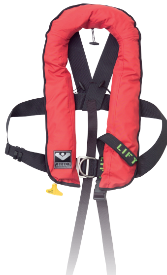
RescYou™ Conquest (PV9273)