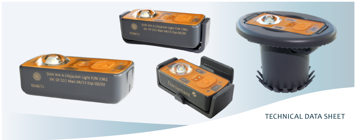
TECHNICAL DATA SHEET