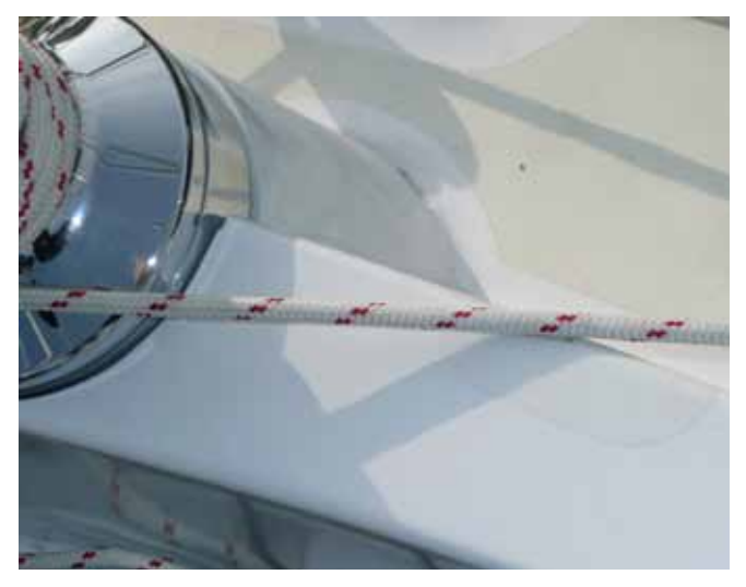
After: the coaming is protected by PSP Anti Chafe patch