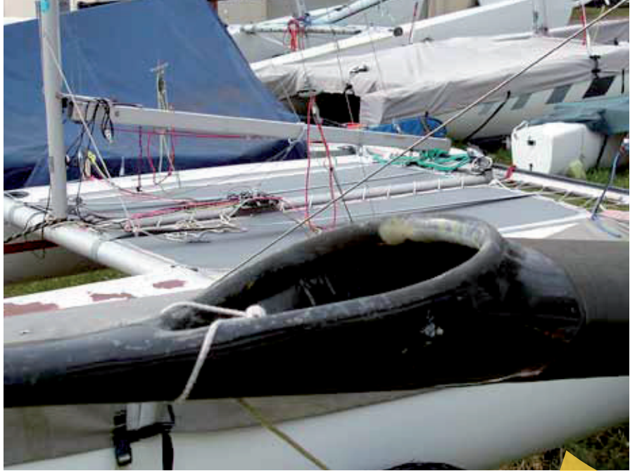
The spinnaker chute edge suffers from rope burns. This can be protected by a PSP Anti Chafe patch, which also reduces friction, allowing the spinnaker to be launched and recovered more easily.