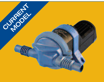
AK2050 Pump head assembly

BP2052(B) (12V d.c. version), BP2054(B) (24V d.c. version)